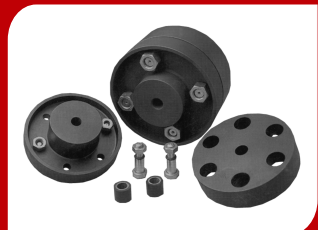
Pin Bush Type Flexible Coupling