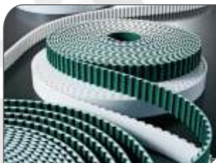
PU Timing Belts