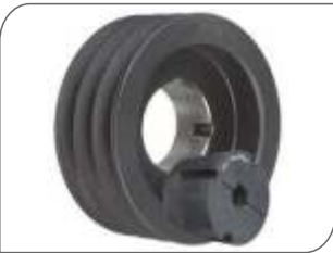
Taper Lock Pulleys