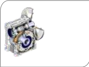
Worm Gear Box