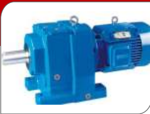
Helical Geared Motor