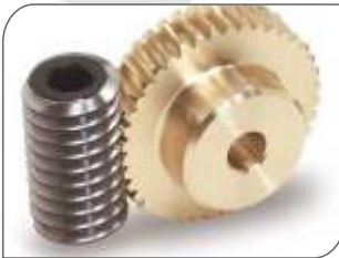
Ph. Bronze Worm Gear Set