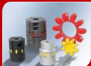
PU Spider Couplings