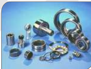
Needle Roller Bearings