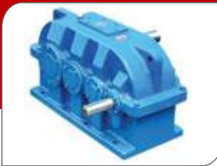
Crane Duty Gear Box