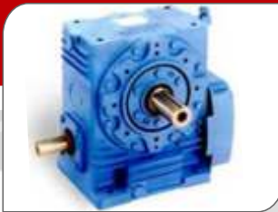
Worm Gear Drive