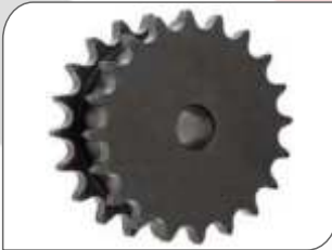
Two Way Type Sprockets