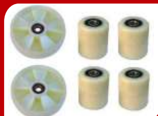
Pallet Trolley Wheels