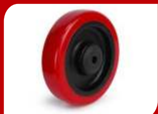
PU Bonded Wheel