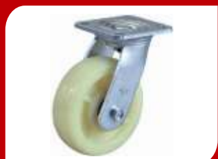
White Nylon Casters