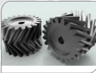
Double Helical Gear