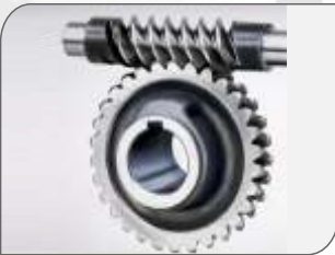
Worm & Worm Wheel