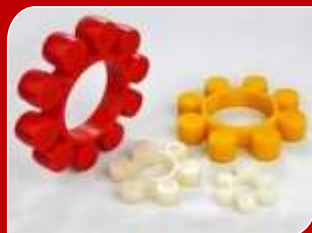
PU Round Spiders