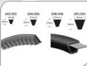
Space Saver Wedge Belts