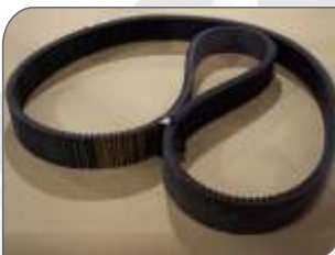
Variable Speed Belts