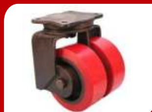
Forged Twin Type Bracket