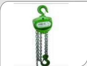
Chain Pulley Block