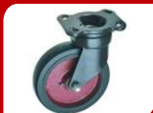
Heavy Duty HSC Casters