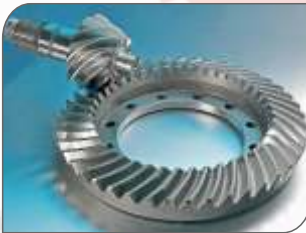
Spiral Bevel Gear