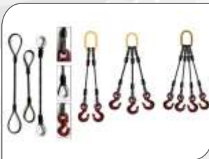
Wire Rope Sling