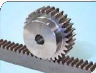
Rack & Pinion