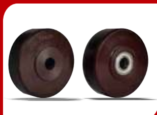
UHMW - PE Trolley Wheels