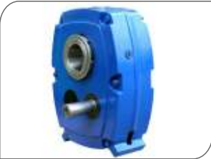
Shaft Mounted Speed Reducer