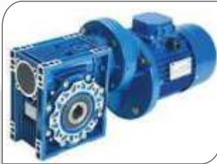
Worm Geared Motor