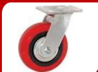
PU Wheel With Bracket