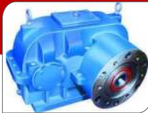
Extruder Gear Box