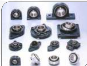
Ball Bearing Units