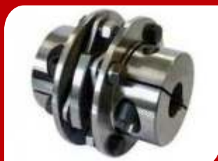
Metal Plate Spring Coupling