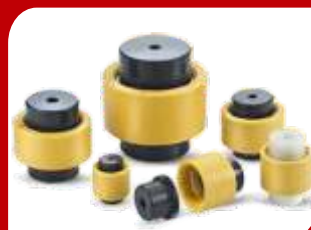
Nylon Sleeve Coupling