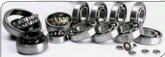
Ball & Spherical Roller Bearings