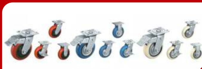
PU / Nylon Wheels with Brake Type Casters