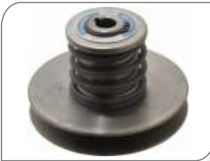
Variable Speed Pulley